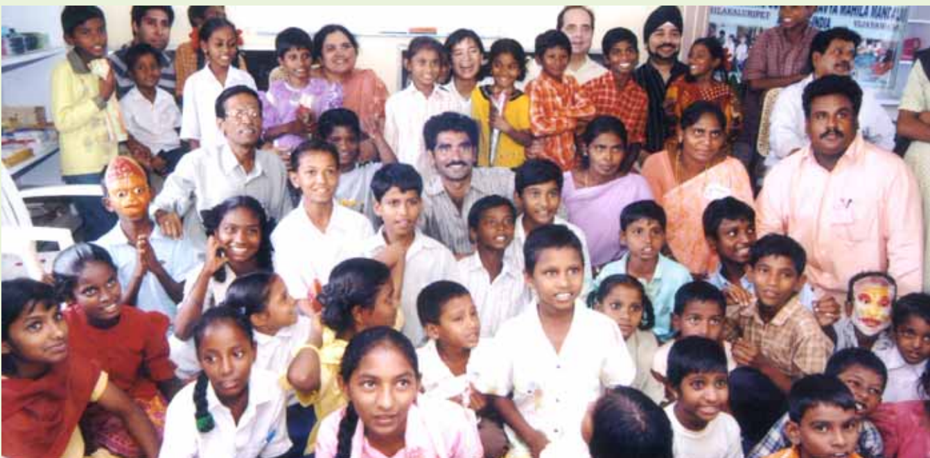
Abbott, Alliance and VMM team with Children & Staff at Needs Serving Society, Chilkaluripet.