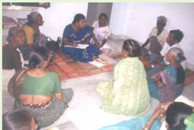
Grannies in action

The issue of orphaning and grand parents mutual dependency the situation has demanded for an innovative approach to cope up the circumstances. One such experiment is Grannies clubs. In the implementation programme of VMM in Vijayawada, grannies club was initiated as a pilot intervention with 30 grannies and they are enjoying this club as it is providing them a place to ventilate their feelings and emotions with other members. Their problems are looking small when they listen to others experiences. One granny is providing psychosocial support to another and the peer psychosocial support is giving a positive attitude for grannies to live longer and to give bright life to their grand children.